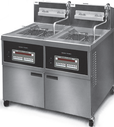
OFG 342 2-well large capacity gas open fryer with Computron™ 8000 control

Henny Penny open fryers offer high-volume frying with programmable operation, oil management functions and fast, easy filtration.