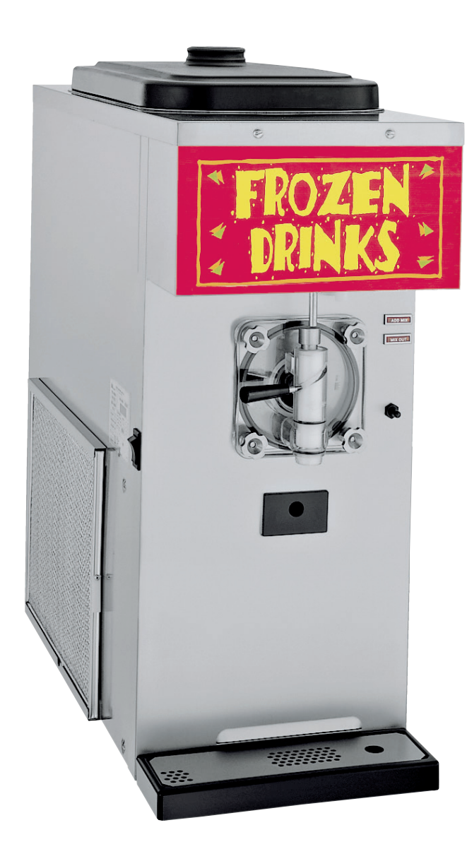
Shown with optional top air discharge chute